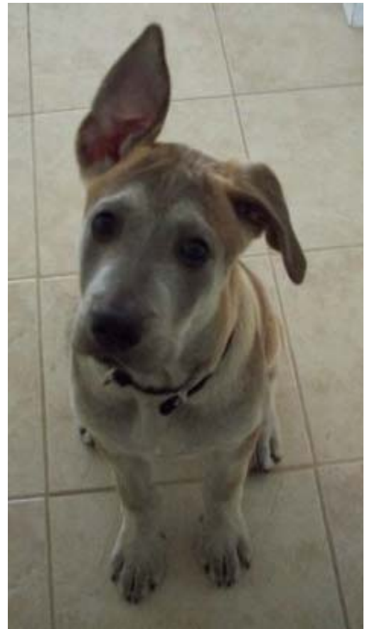
Even as a puppy, Donnie Iris has already mastered the one-ear salute!